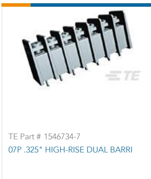
TE Part # 1546734-7 07P .325" HIGH-RISE DUAL BARRI